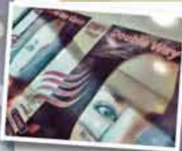
Double Way Vision